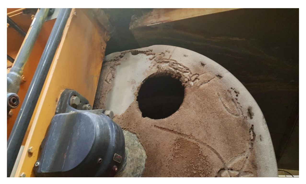
Image 1 – Struvite Removed in Areas Prior to HydroFLOW Installation

A three-month demonstration trial of the HydroFLOW was started on February 17, 2017. The device was installed around the outside of a 6" ductile iron line [Image 2] that feeds anaerobically digested sludge lineto one of the belt filter presses. No pipes were drilled or cut during the installation.