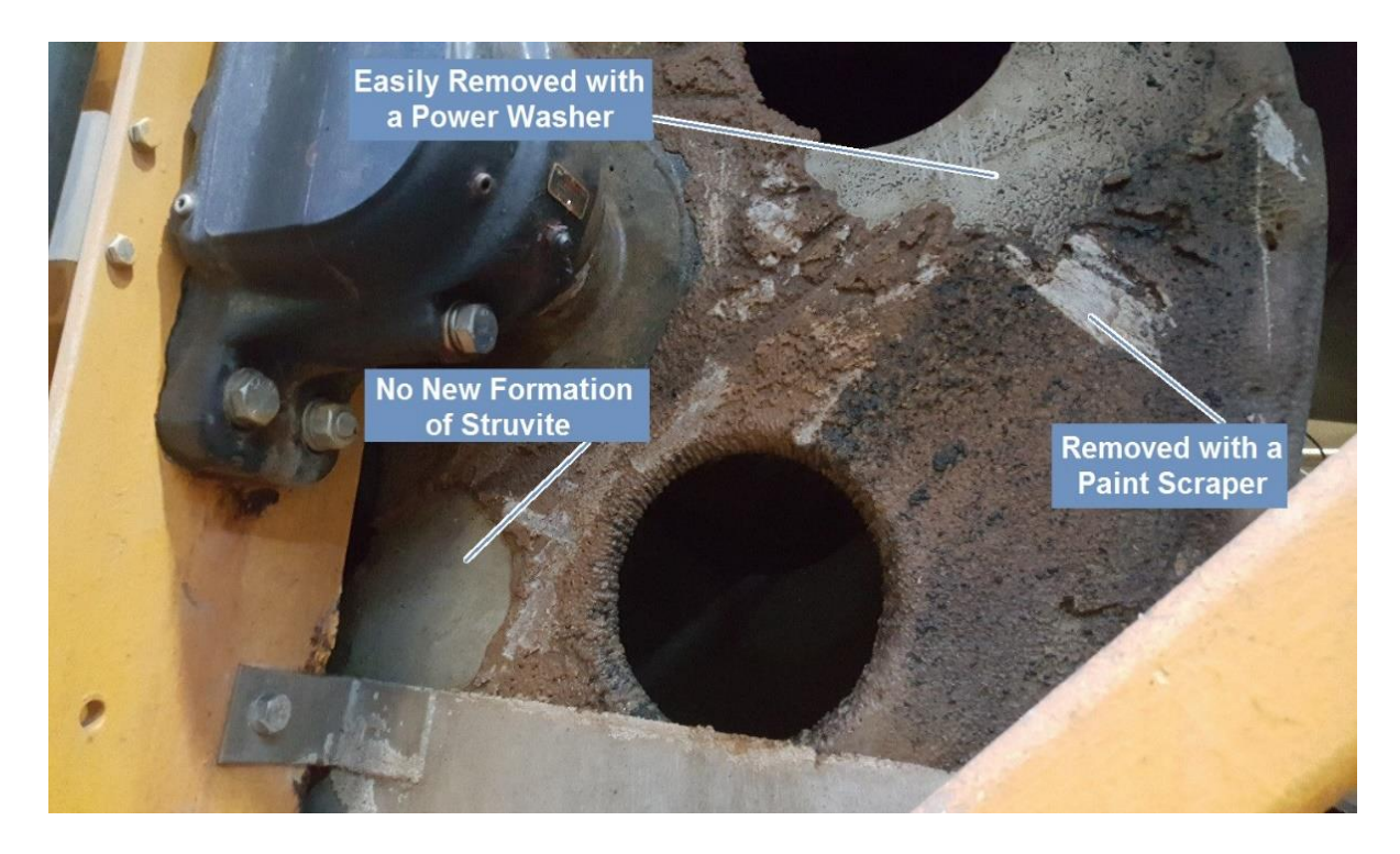
Image 3 – HydroFLOW has Prevented New Struvite and Caused Easy Removal of Existing Struvite